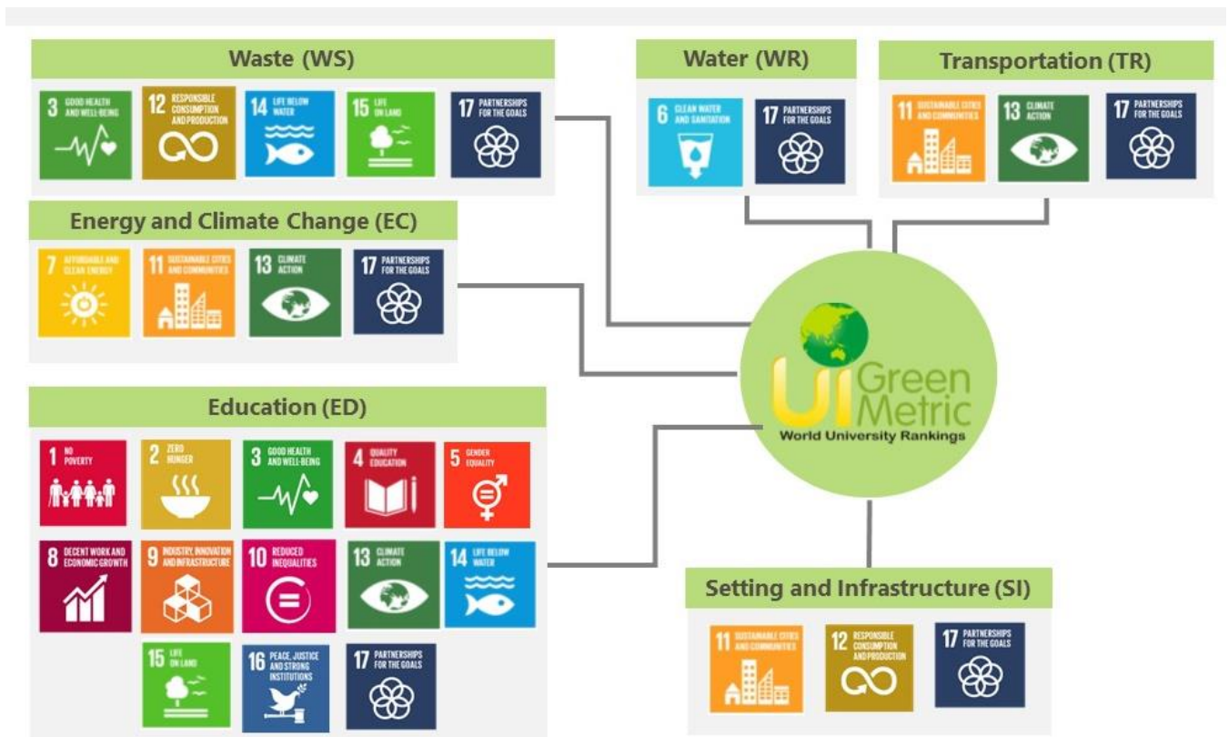
Figure 1. UI GreenMetric and SDGs

UN Environment’s challenge in the 2030 Agenda is to develop and enhance integrated approaches to sustainable development – approaches that will demonstrate how improving the health of the environment will bring social and economic benefits. Aiming at reducing environmental risks and increasing the resilience of societies and the environment, UN Environment action fosters the environmental dimension of sustainable development and leads to socio-economic development (UNEP, n.d.). These 17 aspects of SDGs are captured in the UI GreenMetric criteria and indicators.