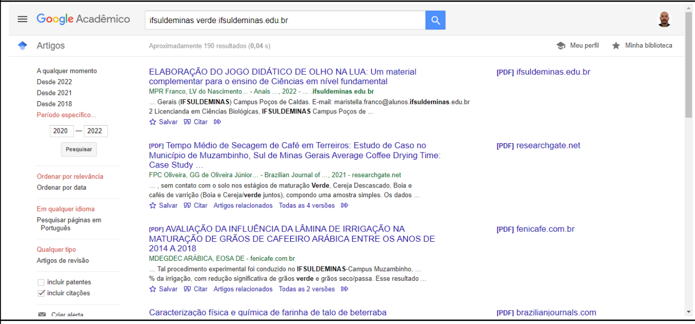
Figure 3. IFSULDEMINAS number of scholarly publications related to environment and sustainability over the last three years with the keyword "green" at Google Scholar search - <u>190 results</u>.