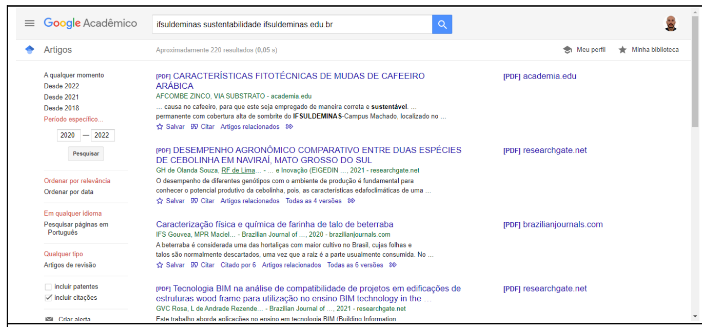
Figure 1. IFSULDEMINAS number of scholarly publications related to environment and sustainability over the last three years with the keyword "sustainability" at Google Scholar search - <u>220 results</u>.