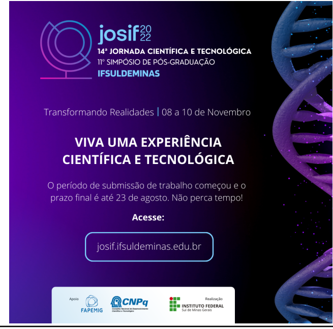
Figure 4: IFSULDEMINAS Scientific and Technological Journey and Postgraduate Symposium poster. Available at:https://josif.ifsuldeminas.edu.br/index.php/josif-2022/.