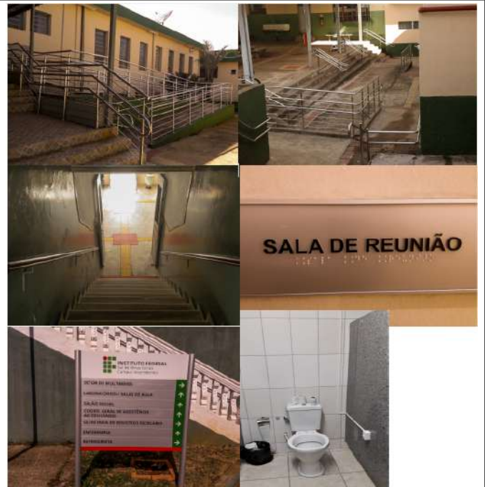
Figure 14: Inconfidentes Campus tactile paving, ramp, handrails, Braille nameplates and bathroom for people with disabilities.