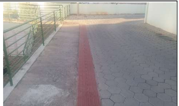
Figure 2: Rectory tactile paving.