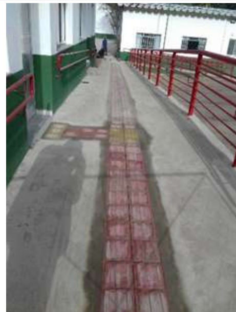
Figure 4: Carmo de Minas Campus tactile paving and handrails.