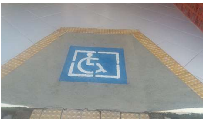
Figure 1: Rectory curb ramp.