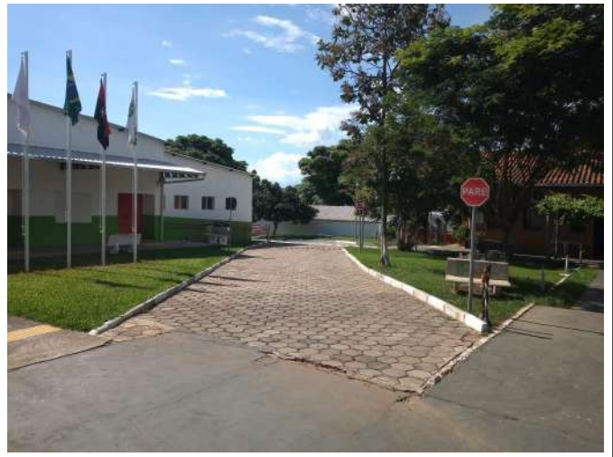
Figure 18: Passos Campus block street and signage.