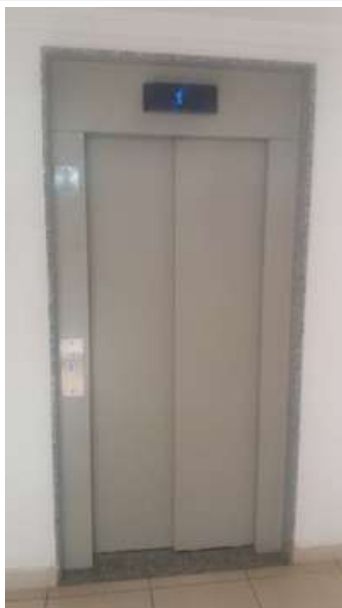
Figure 3: Rectory elevator.