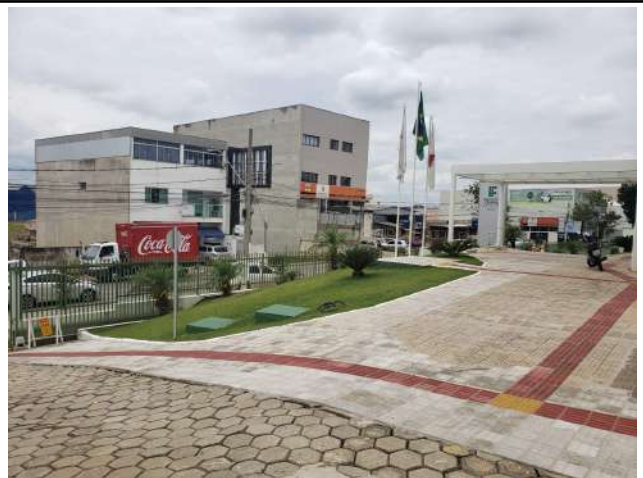
Figure 16: Rectory new tactile paving.