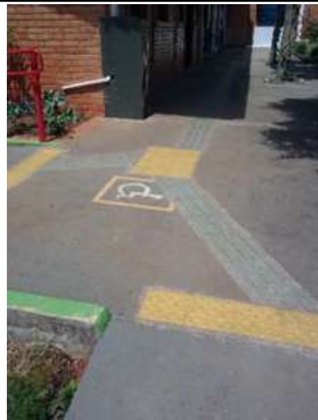
Figure 12: Passos Campus tactile paving.