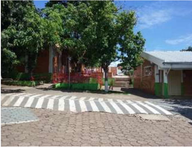
Figure 11: Passos Campus elevated crosswalk.