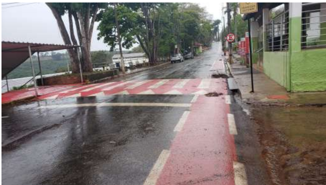
Figure 15: Machado Campus elevated walkway.