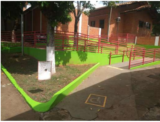
Figure 17: Passos Campus ramp and handrails.