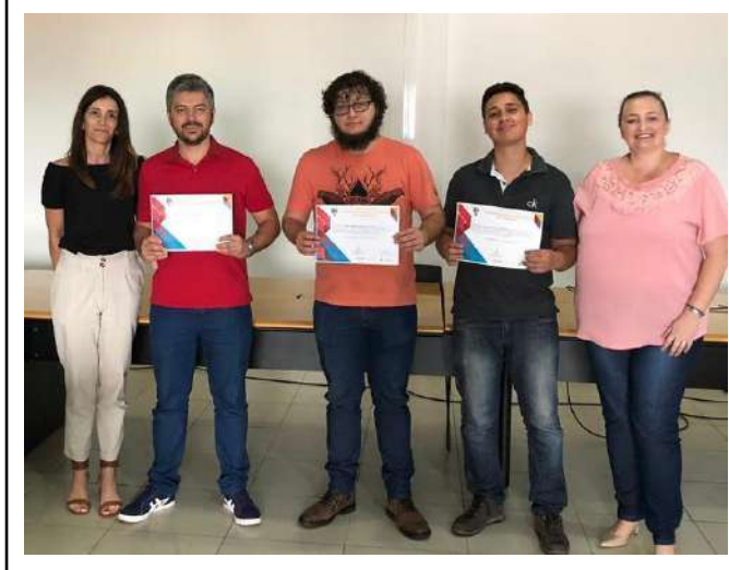
Figure 3: Poços de Caldas Campus – Automation of parking management using Arduino technologies.