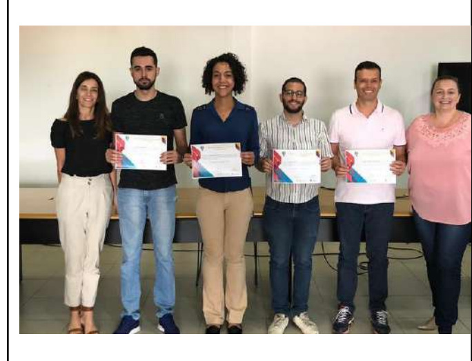
Figure 4: Muzambinho Campus – Gratified Carpool application.