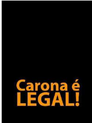
Figure 8: Machado Campus carpooling campaign.