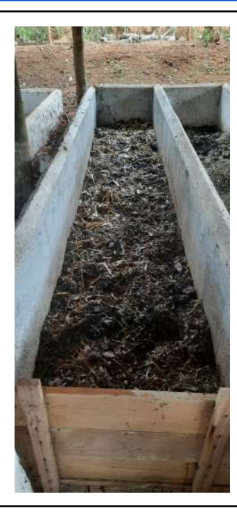
Figure 21: Machado Campus worm farm at compost sector.