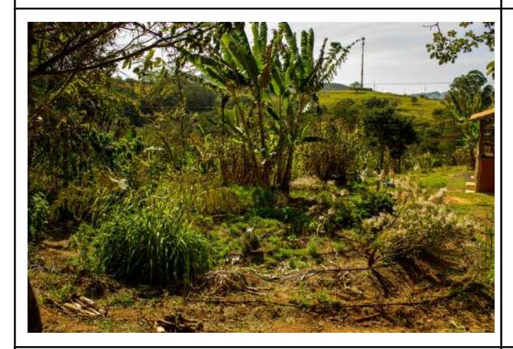
Figure 7: Inconfidentes Campus Agroecology Sector evapotranspiration pit.