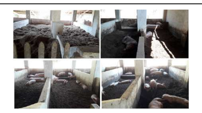
Figure 5: Inconfidentes Campus overlapping bed system for pigs.