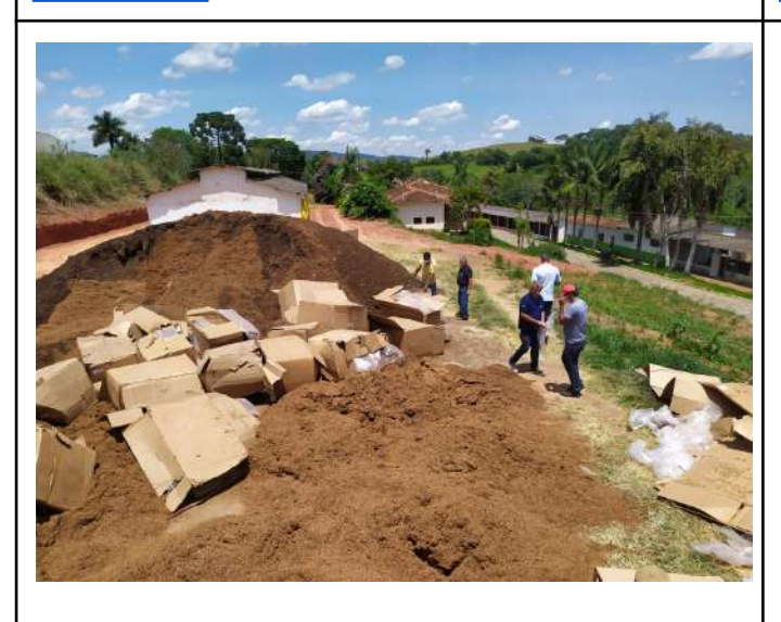
Figure 18: Muzambinho Campus <u>composting of tobacco</u> <u>seized</u> by the <u>Federal Revenue and donated to IFSULDEMINAS</u>.