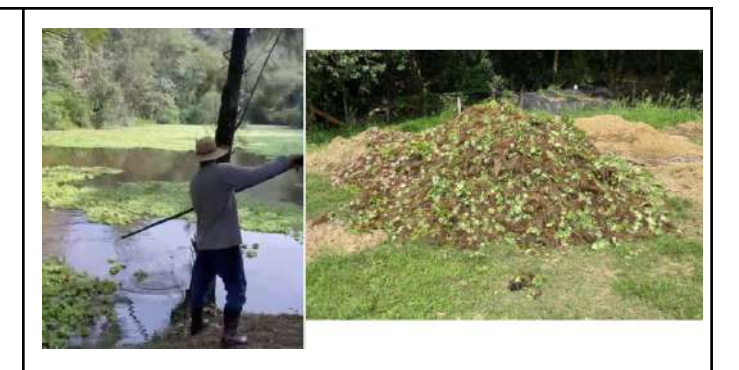
Figure 24: Inconfidentes Campus cleaning of a dam with the destination of vegetable matter for composting.