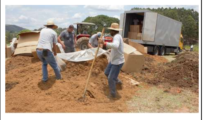
Figure 17: Inconfidentes Campus <u>composting of tobacco</u> <u>seized by the Federal Revenue and donated to IFSULDEMINAS.</u>