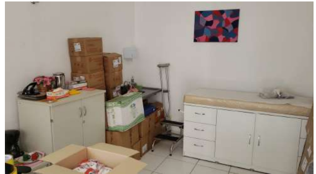
Figure 12: Poços de Caldas Campus Infirmary with boxes of face shields for distribution.