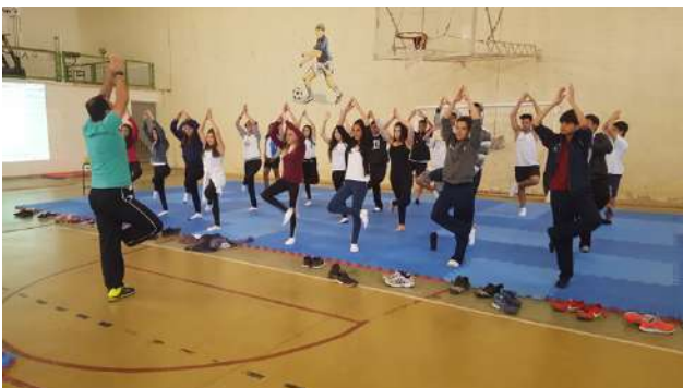
Figure 3: Machado Campus gym.