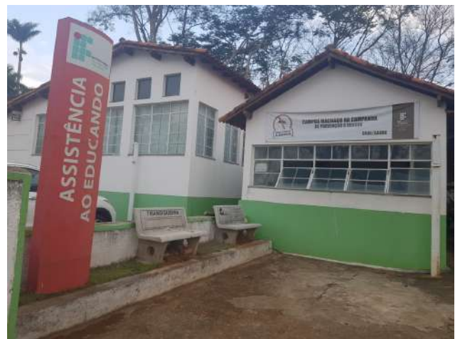
Figure 2: Machado Campus CGAE (General Coordination of Assistance to Students) with psychologists, social worker and disciplinary support.