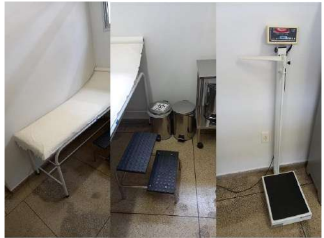
Figure 6: Pouso Alegre Campus Infirmary.