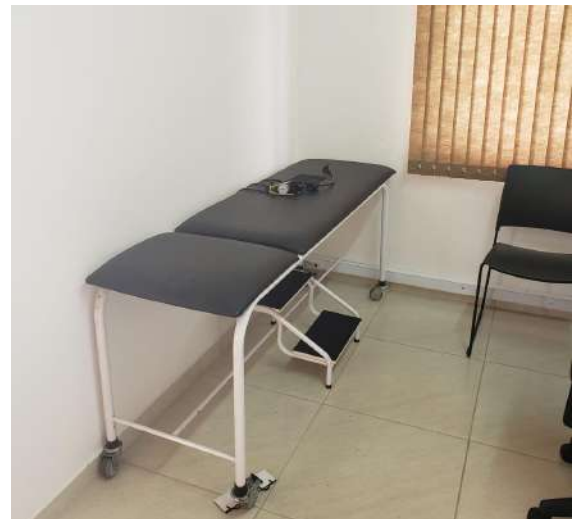
Figure 8: Rectory medical expertise room and infirmary.