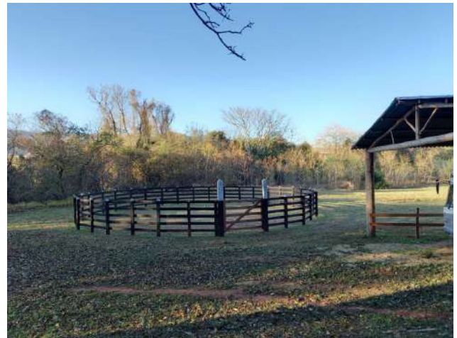
Figure 14: Inconfidentes Campus Hippotherapy Center.