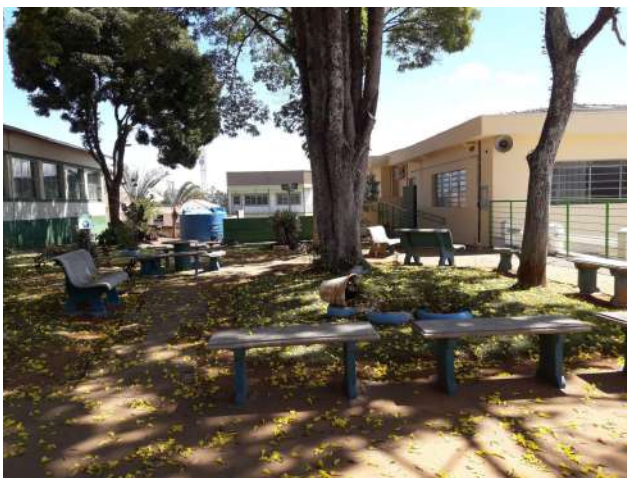
Figure 15: Inconfidentes Campus wooded living area.