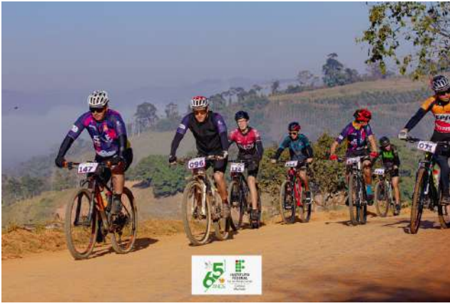
Figure 17: Machado Campus cycling circuit .