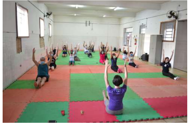
Figure 20: Inconfidentes Campus Yoga practice.