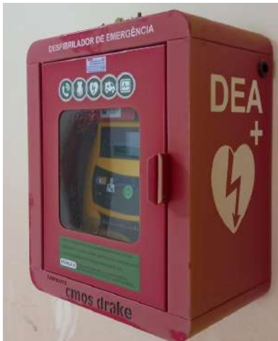
Figure 7: Pouso Alegre Campus emergency defibrillator.