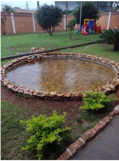
Figure 19: Passos Campus garden pond and playground.