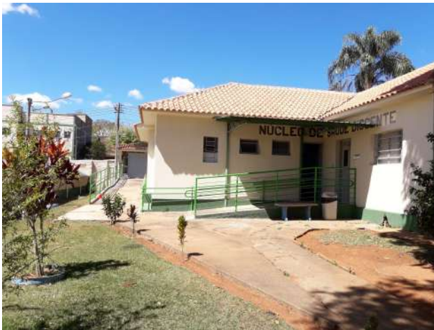
Figure 13: Inconfidentes Campus Student Health Center - infirmary and medical and dental assistance .