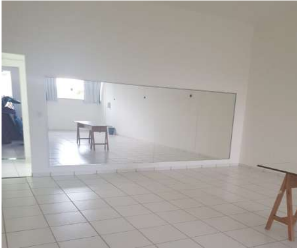
Figure 5: Machado Campus dance and music hall.