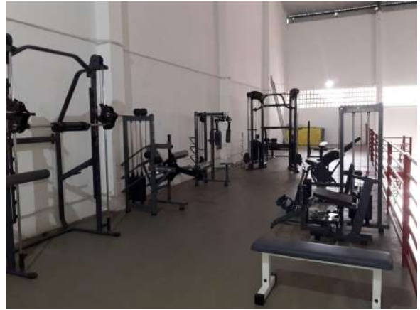
Figure 18: Passos Campus gym.