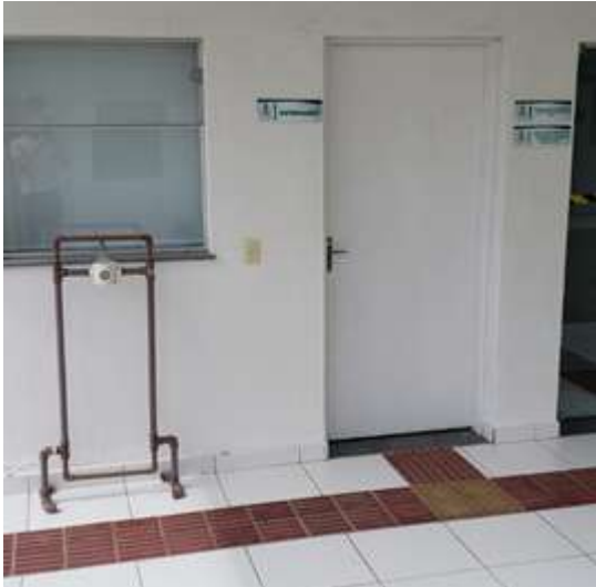
Figure 11: Poços de Caldas Campus Infirmary.