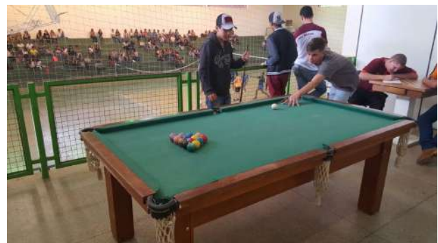
Figure 4: Machado Campus game room.