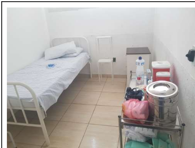
Figure 1: Machado Campus Infirmary.