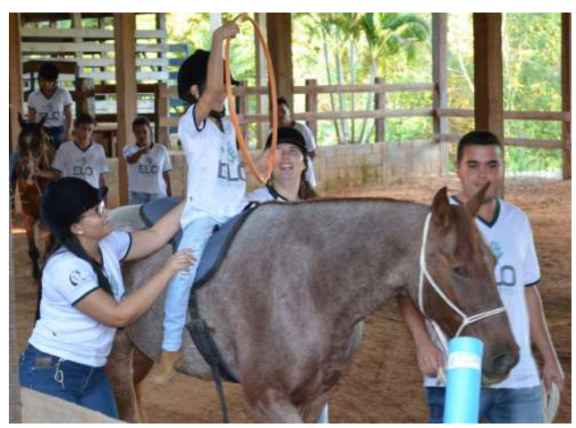
Figure 16: Machado Campus Hippotherapy Center .