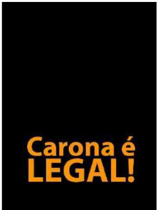
Figure 8: Machado Campus carpooling campaign.