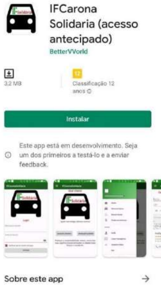
Figure 7: Machado Campus IFCarona Solidária – Hitchhike application.

Evite transporte individual. Quanto mais carros circularem, mais gás carbônico despejamos na atmosfera. Dê carona a seu vizinho, amigo de trabalho ou vá de carona. Além disso, você pode utilizar o transporte público.