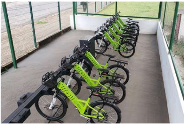
Figure 5: Poços de Caldas Campus electric bicycles available for free .