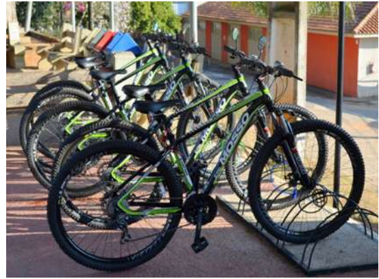
Figure 6: Machado Campus bicycles available for free.