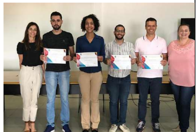
Figure 4: Muzambinho Campus – Gratified Carpool application.