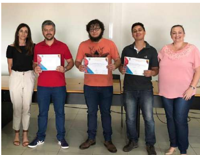
Figure 3: Poços de Caldas Campus – Automation of parking management using Arduino technologies.