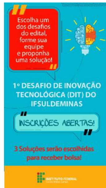
Figure 2: IFSULDEMINAS 1st Technological Innovation Challenge .