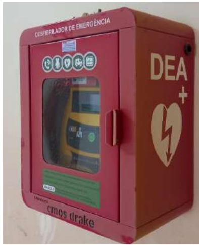
Figure 7: Pouso Alegre Campus emergency defibrillator.