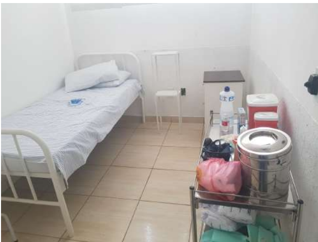
Figure 1: Machado Campus Infirmary.