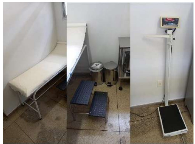
Figure 6: Pouso Alegre Campus Infirmary.