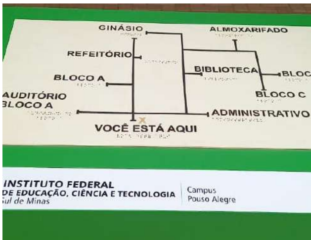
Figure 11: Pouso Alegre Campus map in braille.