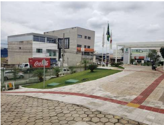
Figure 7: Rectory new tactile paving.