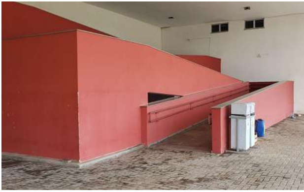
Figure 13: Poços de Caldas Campus ramp and handrails.