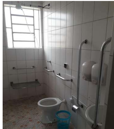
Figure 16: Inconfidentes Campus accessible toilet and shower for people with special needs.