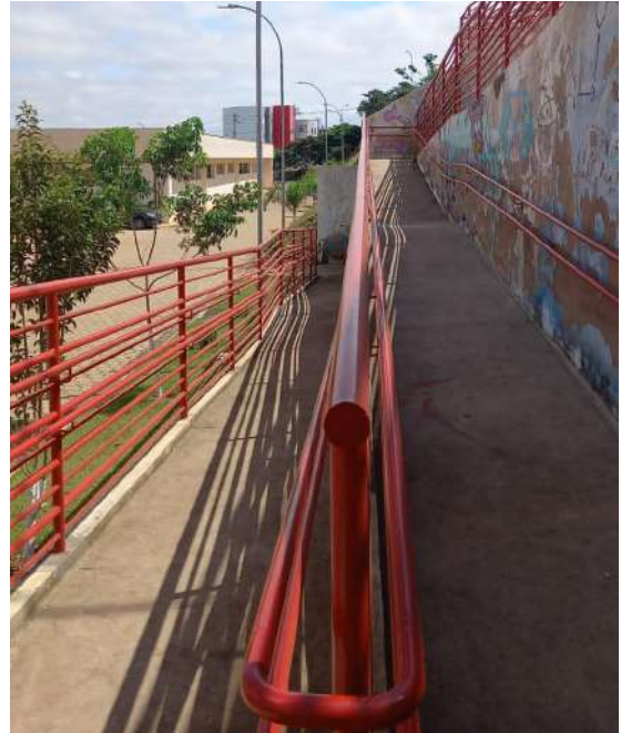
Figure 10: Pouso Alegre Campus ramp and handrails.