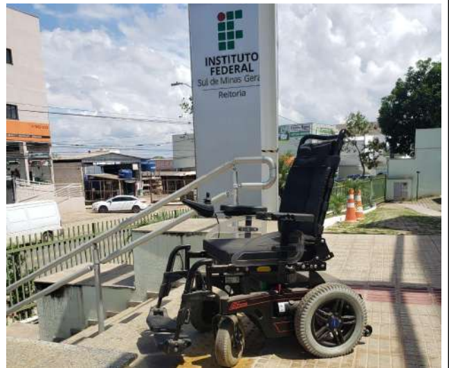
Figure 8: Rectory electric wheelchair.