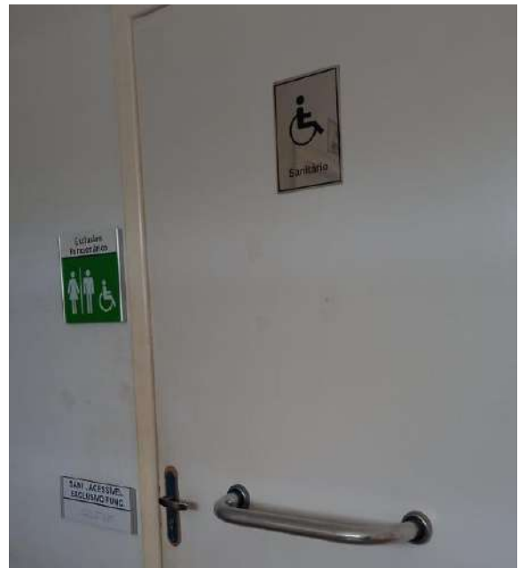
Figure 12: Pouso Alegre Campus accessible toilet for people with special needs.