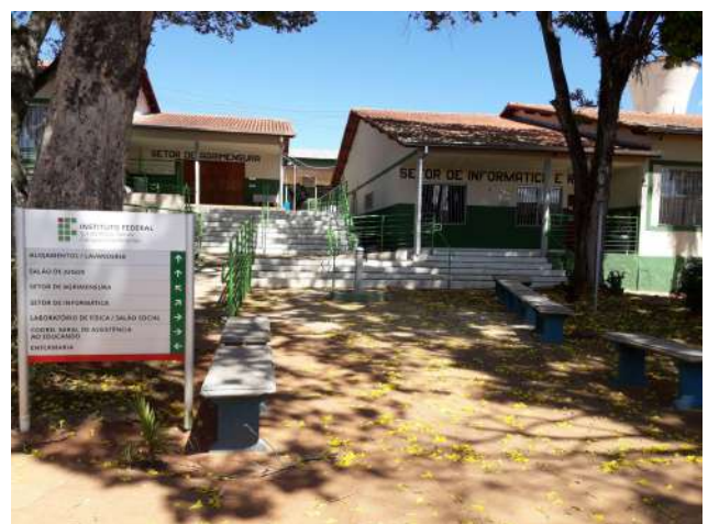
Figure 18: Inconfidentes Campus sector indication board, ramps and handrails.