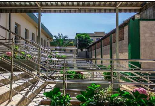
Figure 15: Inconfidentes Campus ramp and handrails.