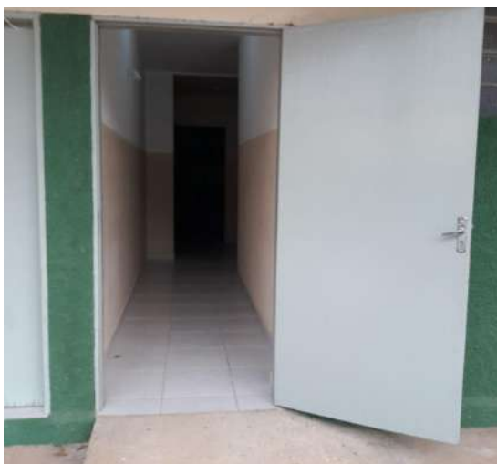
Figure 17: Inconfidentes Campus wide door in student accommodation for wheelchair passage.