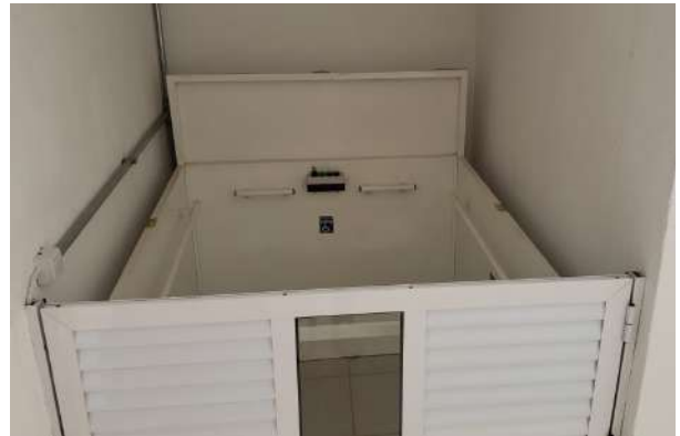
Figure 14: Poços de Caldas Campus elevator for people with special needs.