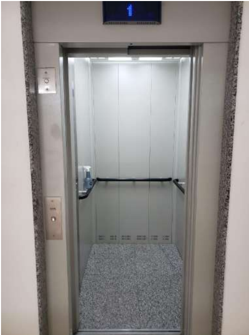
Figure 9: Rectory elevator.