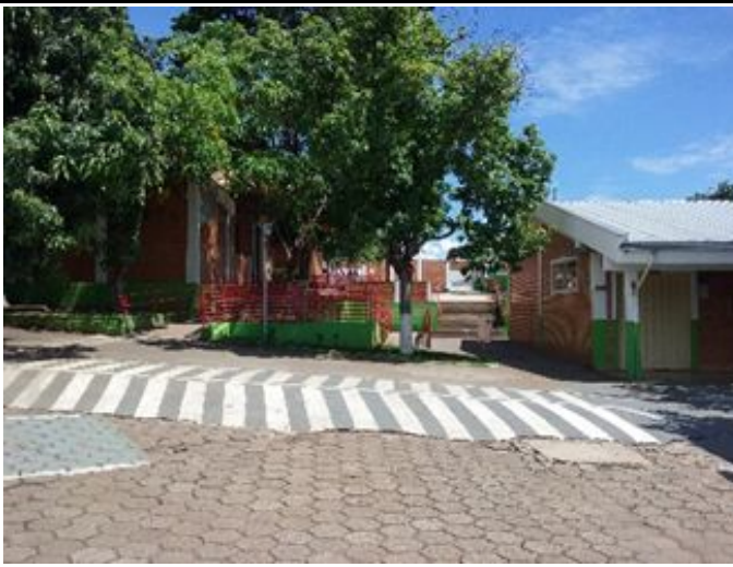
Figure 11: Passos Campus elevated crosswalk.