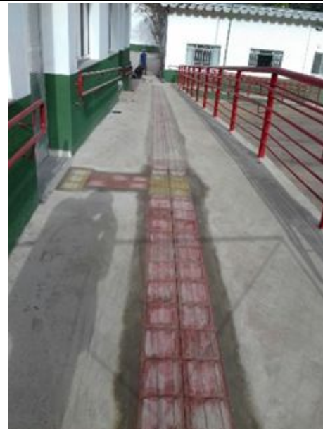
Figure 4: Carmo de Minas Campus tactile paving and handrails.