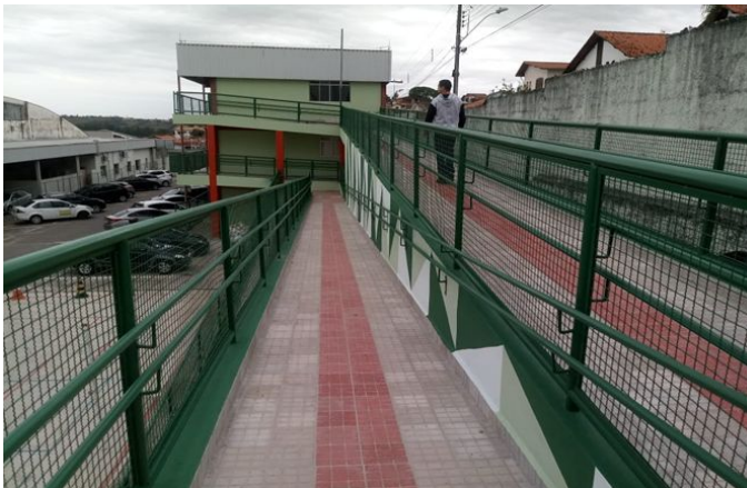
Figure 9: Três Corações Campus tactile paving, ramp and handrails.