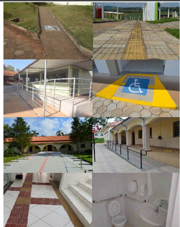
Figure 10: IFSULDEMINAS works carried out to suit and include people with disabilities.