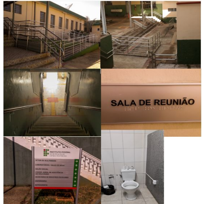
Figure 14: Inconfidentes Campus tactile paving, ramp, handrails, Braille nameplates and bathroom for people with disabilities.