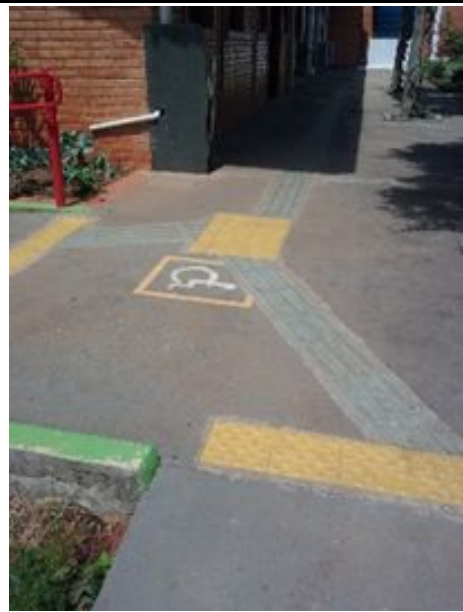
Figure 12: Passos Campus tactile paving.