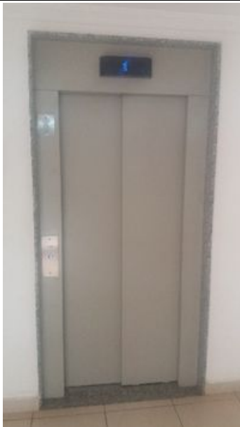
Figure 3: Rectory elevator.