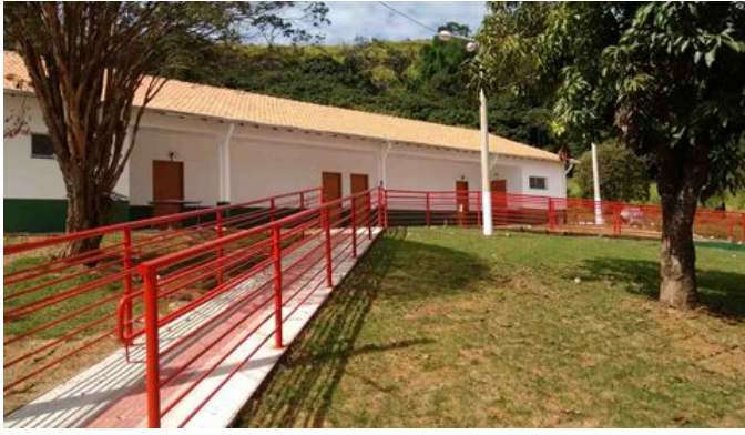
Figure 5: Carmo de Minas Campus tactile paving and handrails.