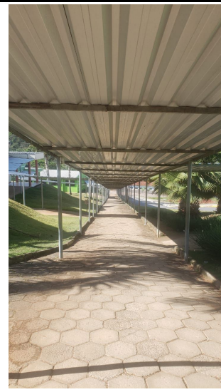
Figure 6: Machado Campus covered sidewalk.