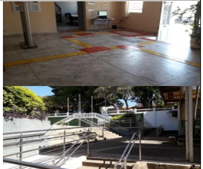
Figure 8: Inconfidentes Campus tactile paving, ramp and handrails.