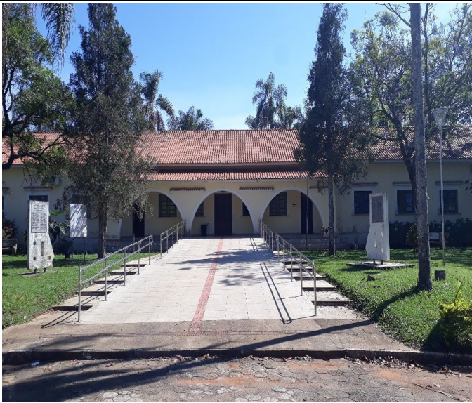
Figure 7: Muzambinho Campus tactile paving, ramp and handrails.