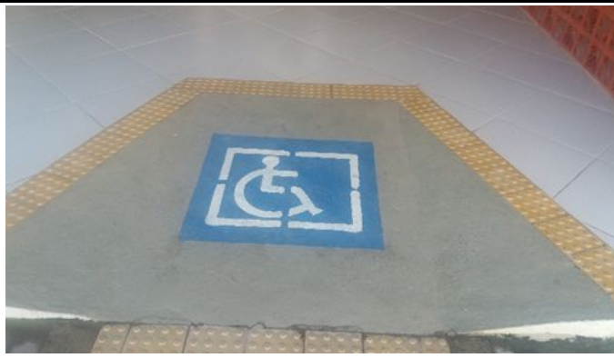
Figure 1: Rectory curb ramp.