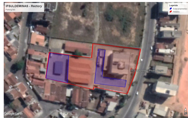
Figure 8: Pouso Alegre Campus parking lots.