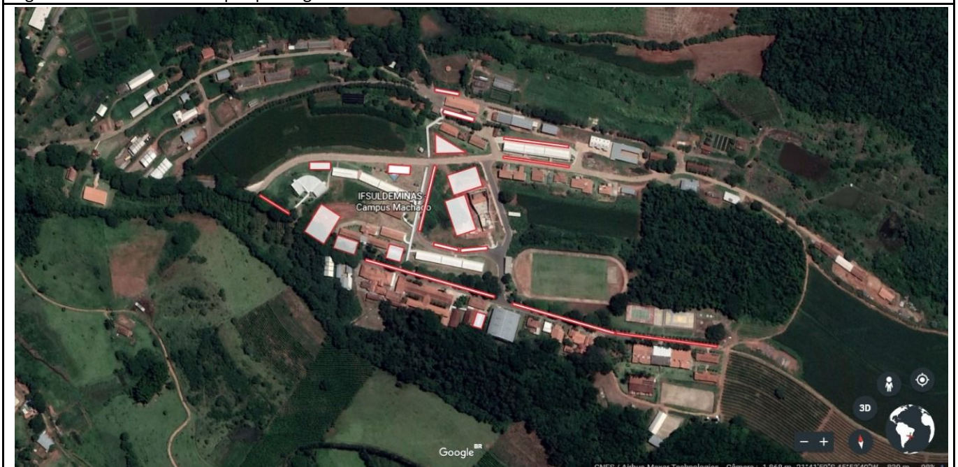
Figure 2: Machado Campus parking lots.