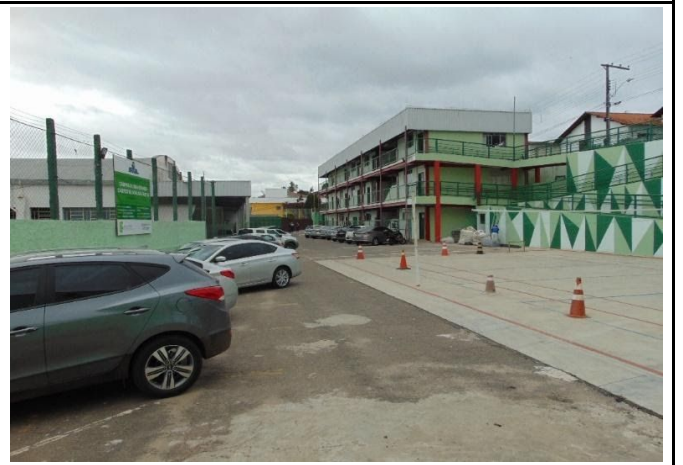
Figure 5: Três Corações Campus parking lots.