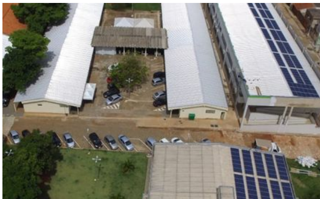
Figure 6: Passos Campus parking lots.