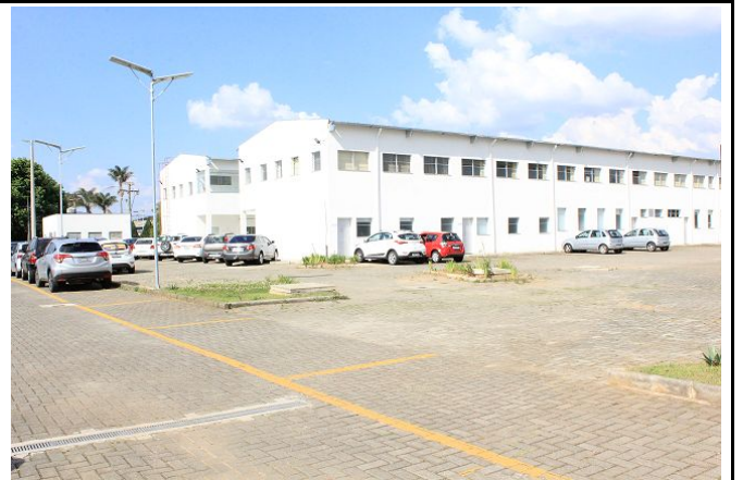
Figure 7: Poços de Caldas Campus parking lots.