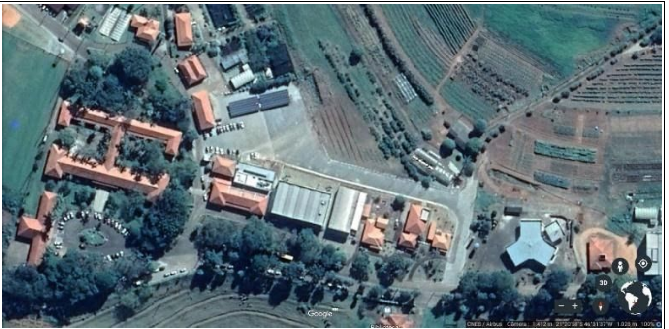
Figure 3: Muzambinho Campus parking lots.