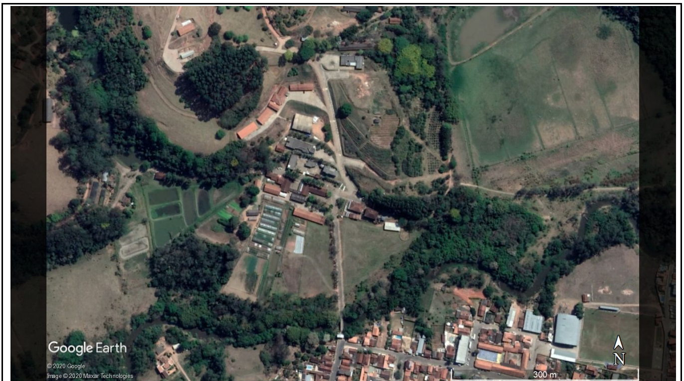
Figure 1: Inconfidentes Campus parking lots.