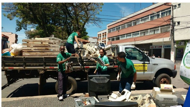
Figure 1: IFSULDEMINAS Electronic Junk Collection Week.