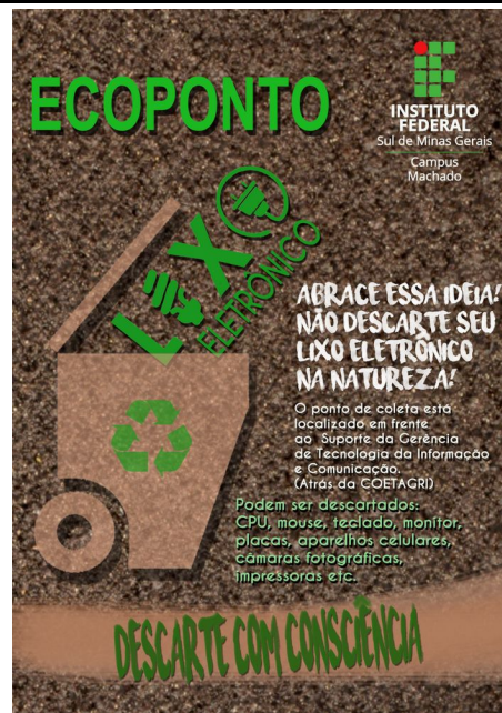
Figure 6: Machado Campus students academic work on the disposal of electronic waste.