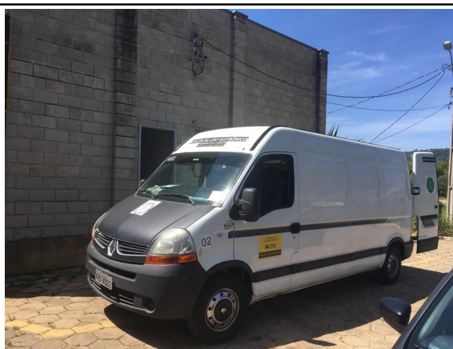
Figure 2: Inconfidentes Campus Information Technology sector disposal of electronic materials