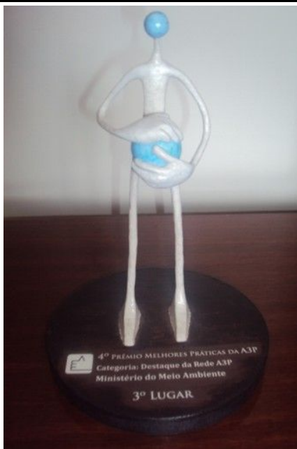
Figure 5: Passos Campus A3P best practices award.