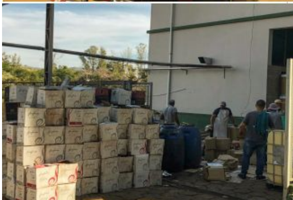
Figure 3: Inconfidentes Campus solidary selective collection made by the ACAMARE.