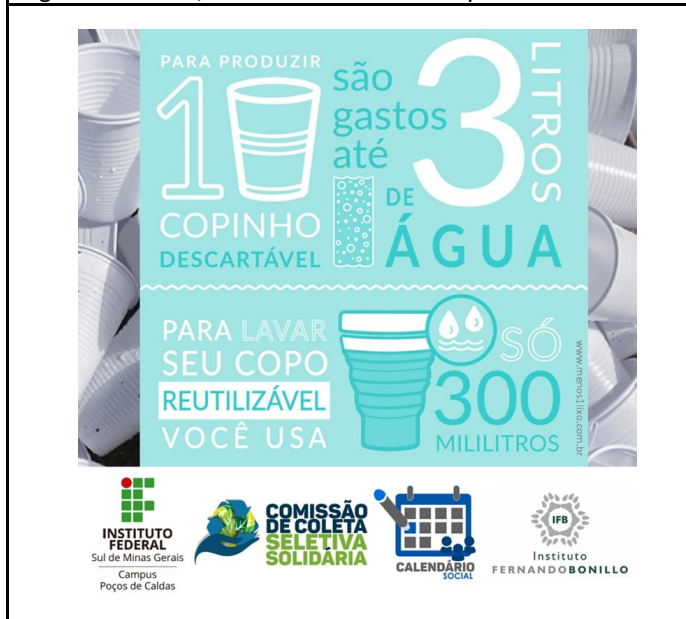
Figure 3: IFSULDEMINAS mug usage policy.