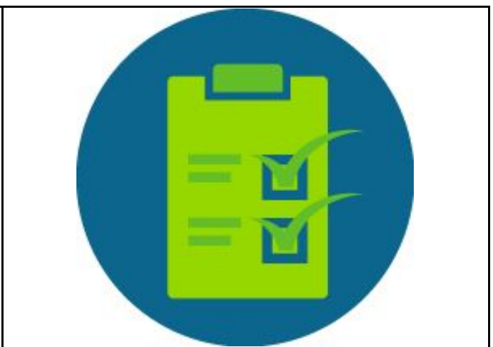
Figure 2: Standard n. 287/2018 and Standard n. 109/2019.