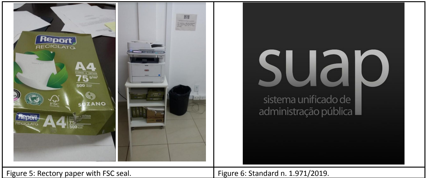
Figure 5: Rectory paper with FSC seal.