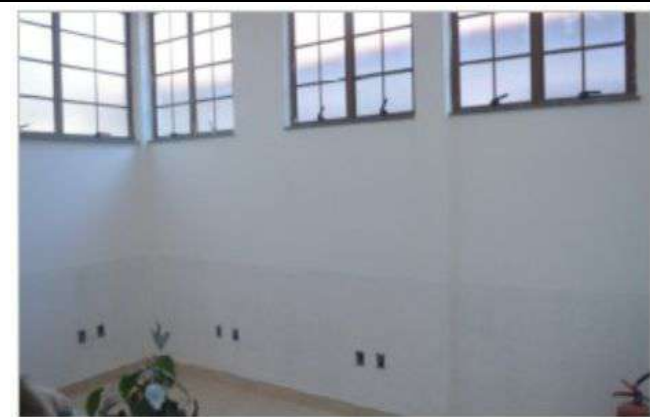
Figure 6: Campus Machado room natural ventilation.