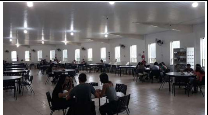
Figure 2: Campus Machado library natural lighting.