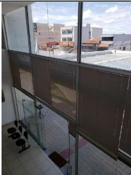
Figure 11: Rectory entrance natural lighting.