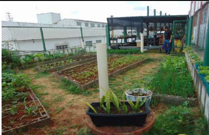
Figure 9: Campus Três Corações vegetable garden.