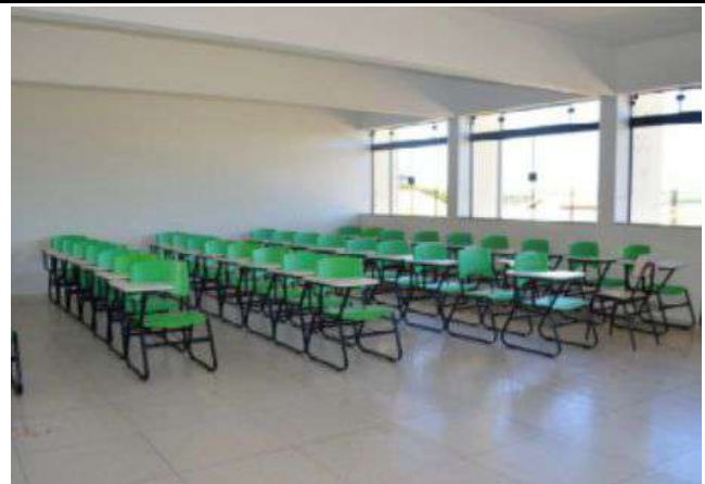
Figure 4: Campus Muzambinho natural ventilation and lighting.