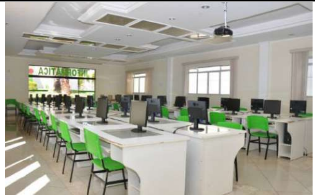
Figure 16: Campus Muzambinho computer lab natural lighting.