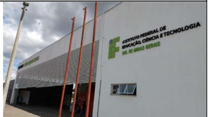
Figure 20: Campus Poços de Caldas building facade brise-soleil.