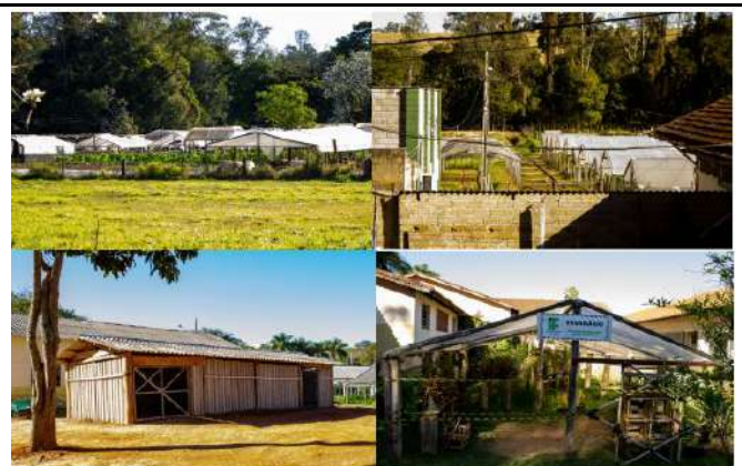
Figure 22: Inconfidentes Campus vegetable garden, shed made of reused materials and herbal store.