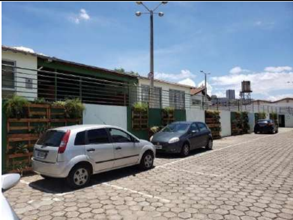
Figure 17: Rectory vertical garden.