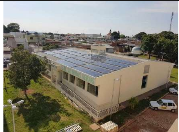
Figure 18: Campus Passos library natural lighting.