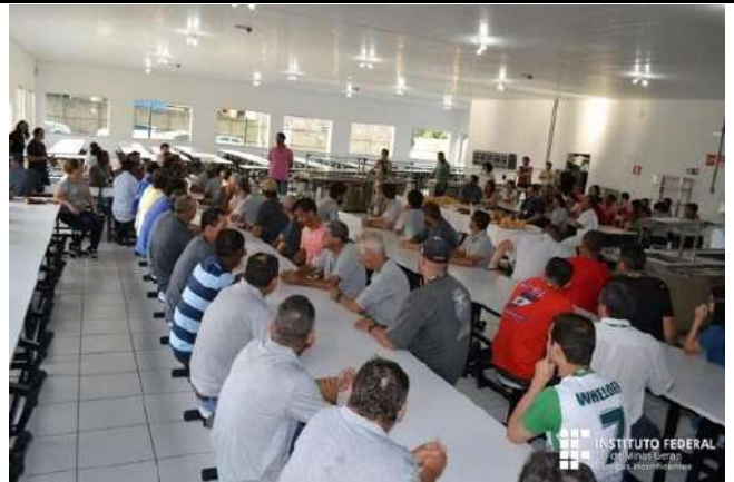
Figure 10: Campus Inconfidentes restaurant natural lighting.