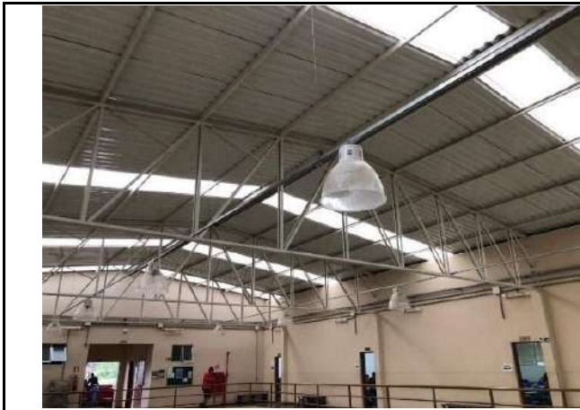
Figure 7: Campus Pouso Alegre Engineering Building natural lighting.