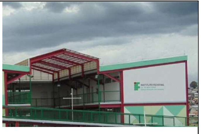
Figure 8: Campus Três Corações natural ventilation and lighting.