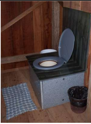
Figure 23: Inconfidentes Campus dry toilet at Agroecology Sector.