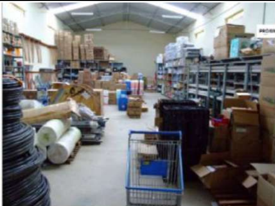
Figure 5: Campus Machado stockroom natural ventilation.