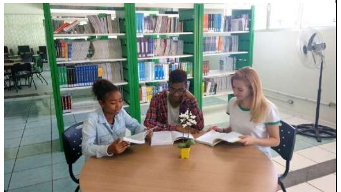
Figure 12: Campus Três Corações library natural lighting.