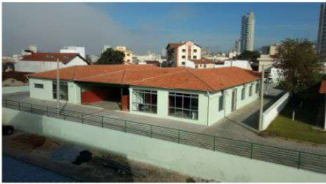
Figure 1: Rectory natural ventilation and lighting