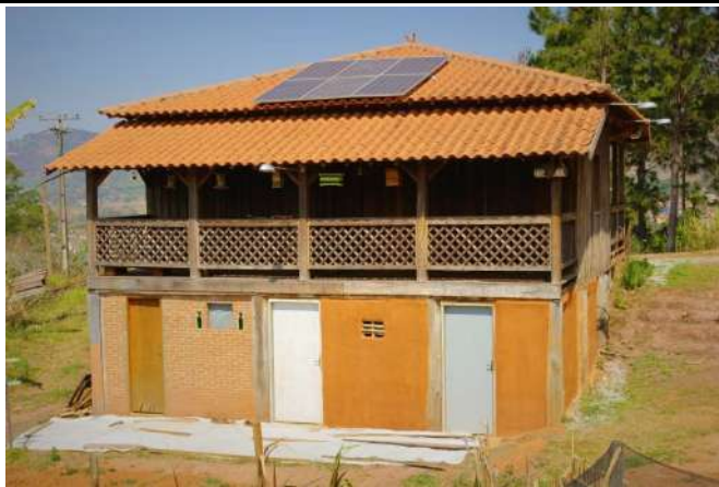
Figure 3: Campus Inconfidentes Sustainable House, built by students - Agroecology Sector.