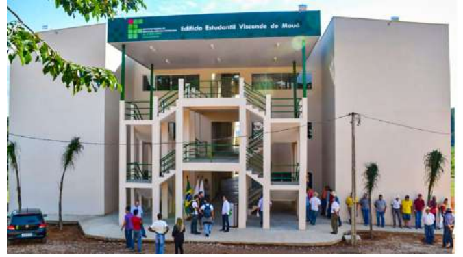
Figure 24: Inconfidentes Campus Visconde de Mauá student building natural ventilation and lighting.