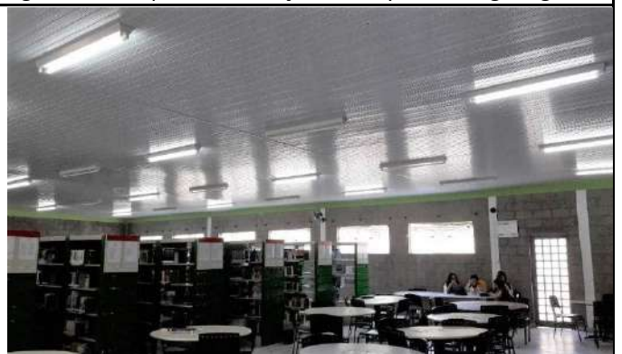
Figure 14: Campus Inconfidentes library natural lighting.