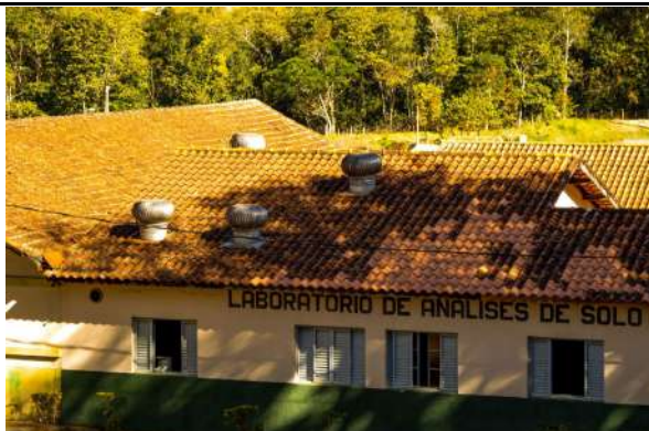
Figure 19: Campus Inconfidentes Soil Analysis Laboratory exhausters.