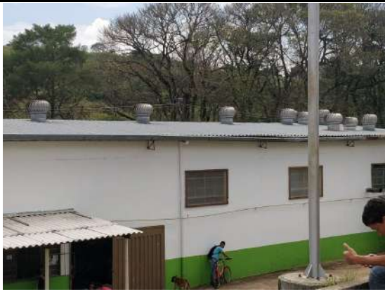
Figure 15: Campus Machado Coffee Roasting Building exhausters.