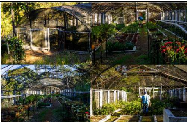
Figure 21. Inconfidentes Campus greenhouses.