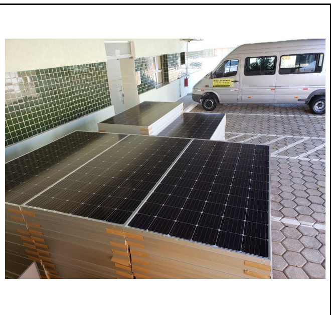
Figure 18: Rectory new photovoltaic plates to be installed (photo taken on 10/28/2020).