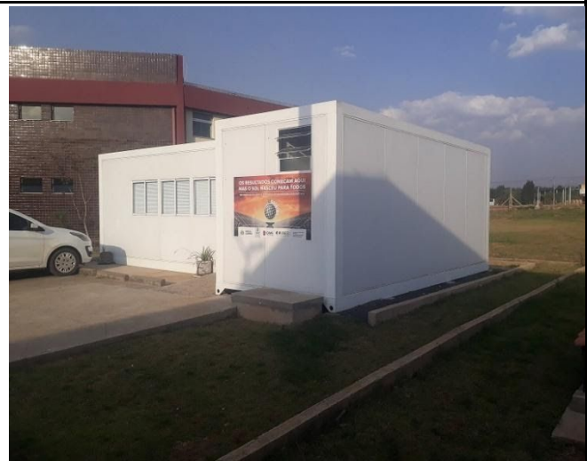
Figure 8: Campus Poços de Caldas Energy Efficiency and Renewable Energy laboratory (LEFEER).