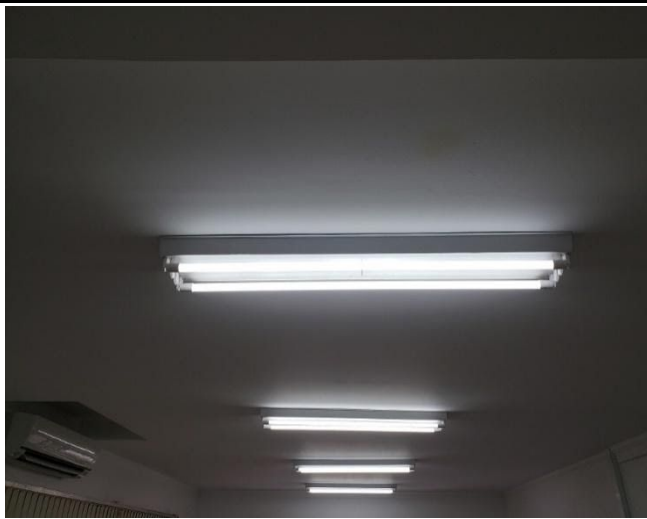
Figure 3: Rectory LED tubular lights.