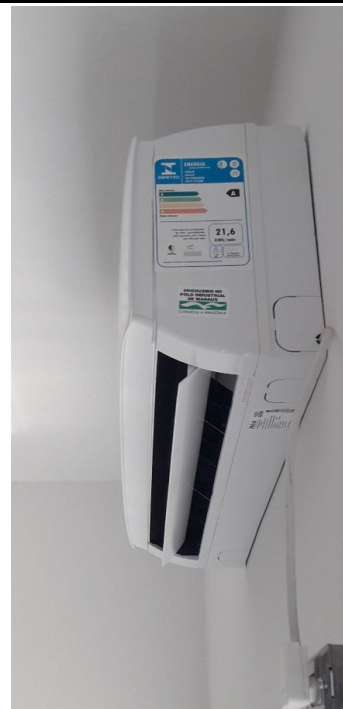
Figure 6: Campus Carmo de Minas efficient air conditioning.