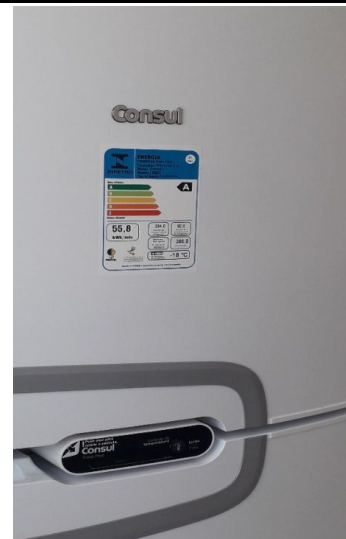
Figure 4: Campus Carmo de Minas efficient refrigerator.