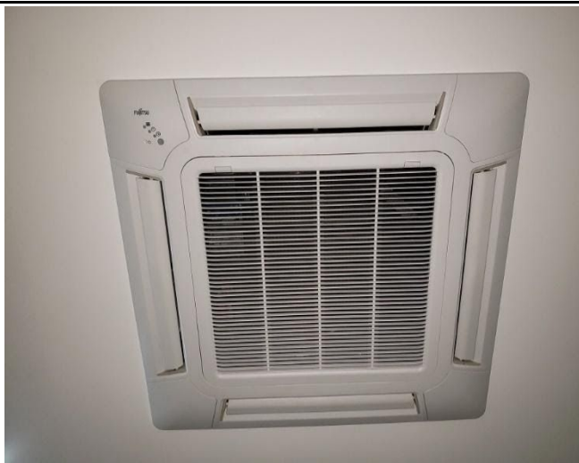
Figure 7: Rectory efficient air conditioning.