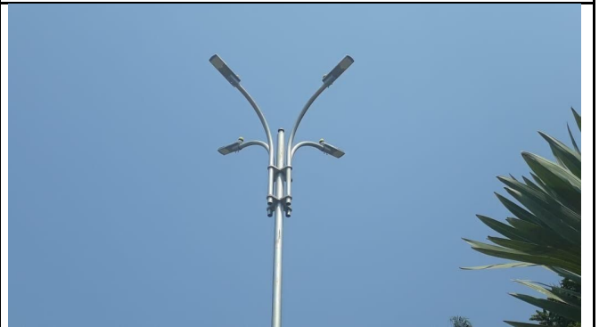
Figure 16: Campus Muzambinho new LED lamps.