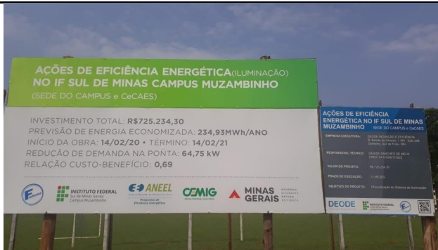
Figure 15: Campus Muzambinho replacement of lighting for conventional lamps by LED lamps.