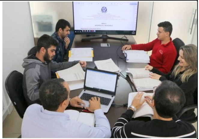
Figure 14: IFSULDEMINAS renewable energy bidding expertise.