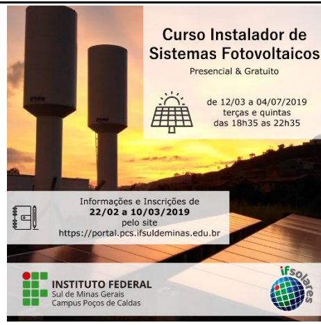
Figure 12: Campus Poços de Caldas Photovoltaic Systems Installer course in Initial and Continuing Education (FIC).