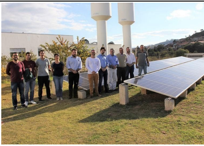
Figure 11: IFSULDEMINAS and DME celebrate results of the first phase of the “IF Solares” Project.