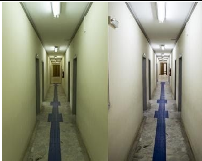
Figure 9: Campus Inconfidentes previous lighting compared to new LED lighting.