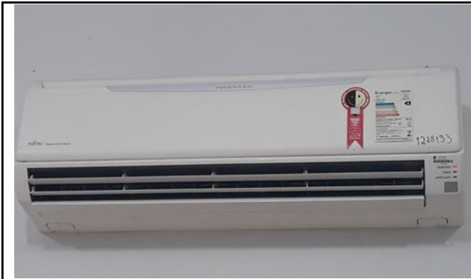
Figure 1: Campus Muzambinho efficient air conditioning.