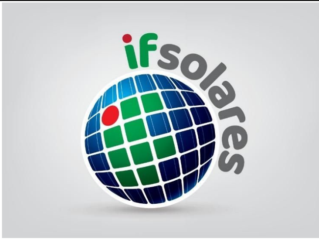
Figure 13: IFSULDEMINAS is selected in public call with solar power project.