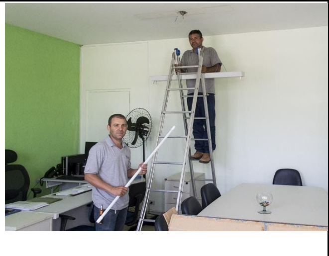
Figure 10: Campus Inconfidentes replacing the lighting in the main building.