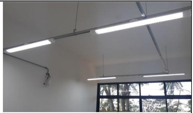
Figure 2: Campus Muzambinho LED tubular lights.