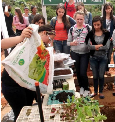
Figura 1: Tree Day