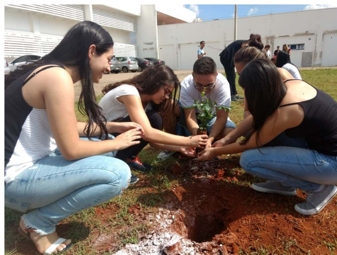
Figura 4: Students Plant 40 Tree Seedlings