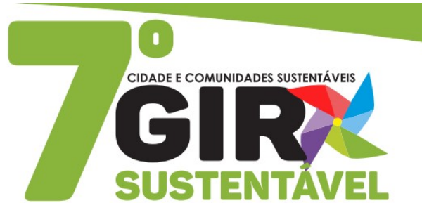
Figura 2: 7th Sustainable Spin