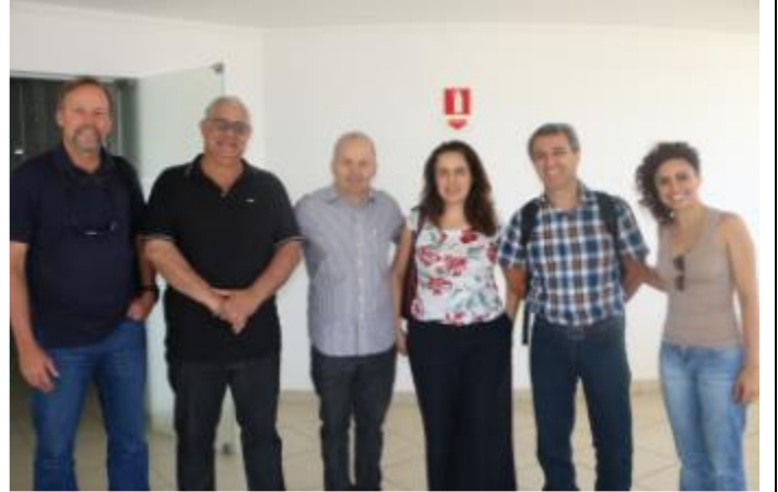
Figura 2 IFSULDEMINAS gathers NGOs and municipalities to make feasible the Mantiqueira Conservative