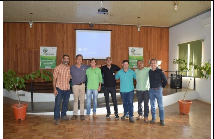
Figura 4 Forest Restoration Course at Muzambinho Campus