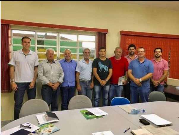
Figura 3 Meeting between Campus and Inconfidentes City Hall