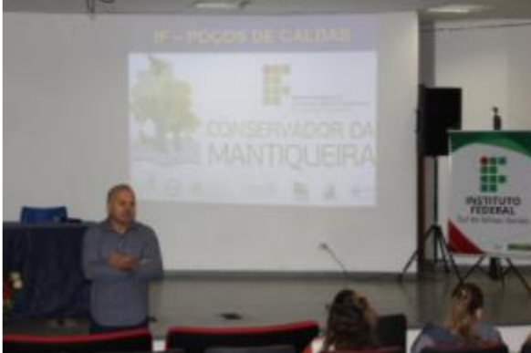
Figura 1 First meeting of the Mantiqueira Conservative Plan at Campus Poços de Caldas