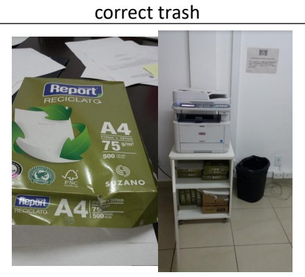
3 - Logistic of paper – Rectory IFSULDEMINAS