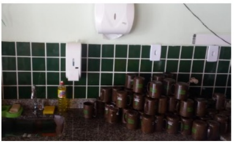
2 - Plastic reduction policy