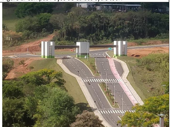
Figure 4: Campus Machado new road junction with cycle way.