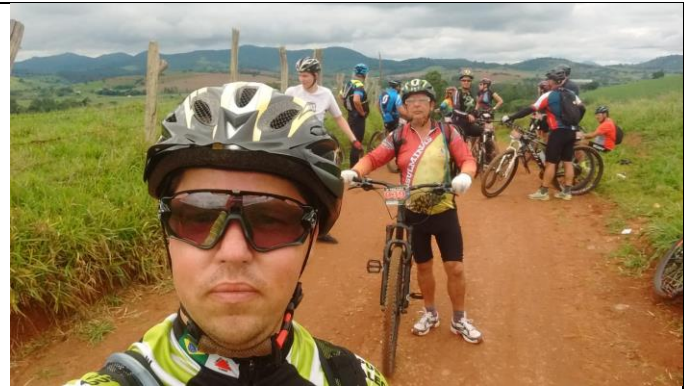
Figure 6: Campus Pouso Alegre bike group.