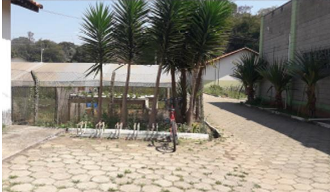
Figure 5: Campus Inconfidentes bicycle rack.