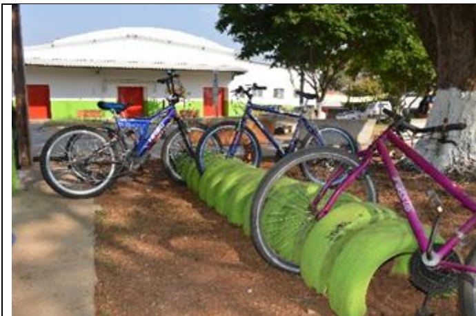
Figure 1: Campus Passos bicycle rack built with tires.