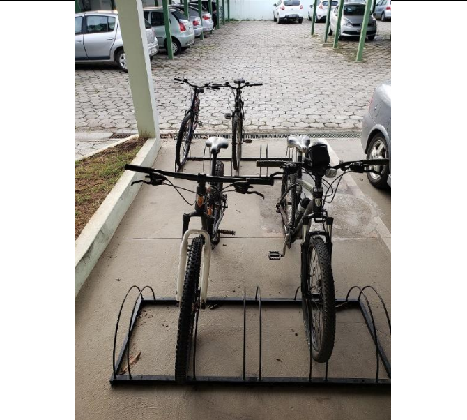
Figure 7: Rectory bicycle rack.