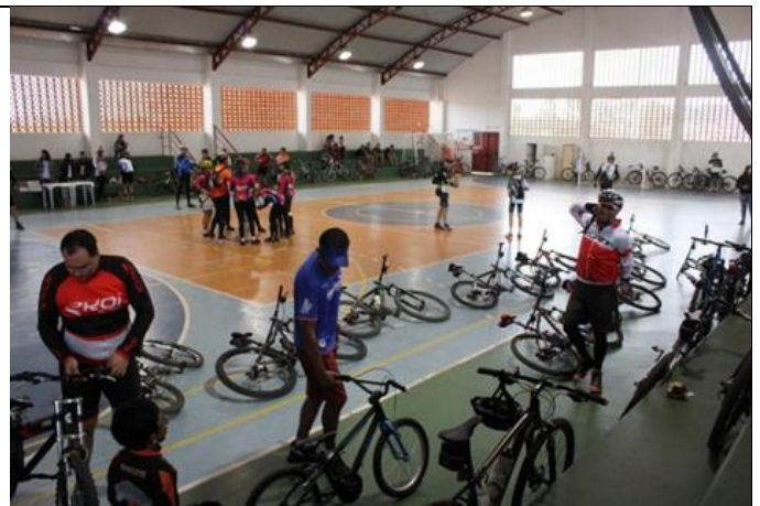
Figure 2: Campus Poços de Caldas cycle tour.