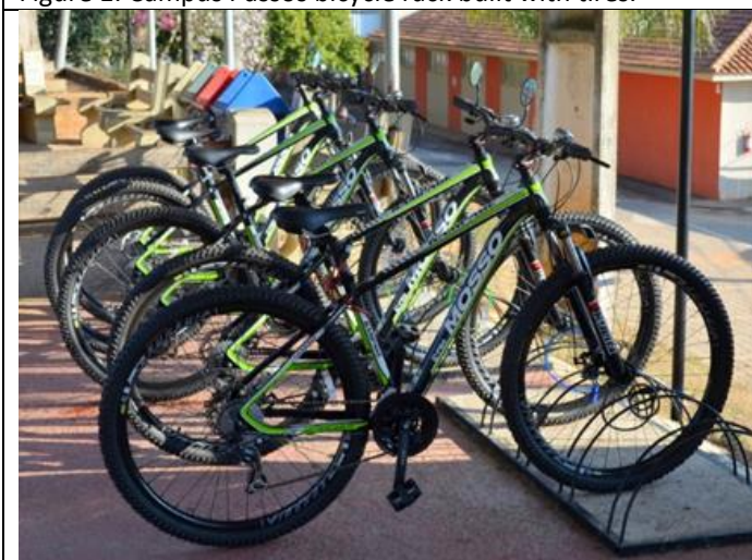
Figure 3: Campus Machado bicycles available free.