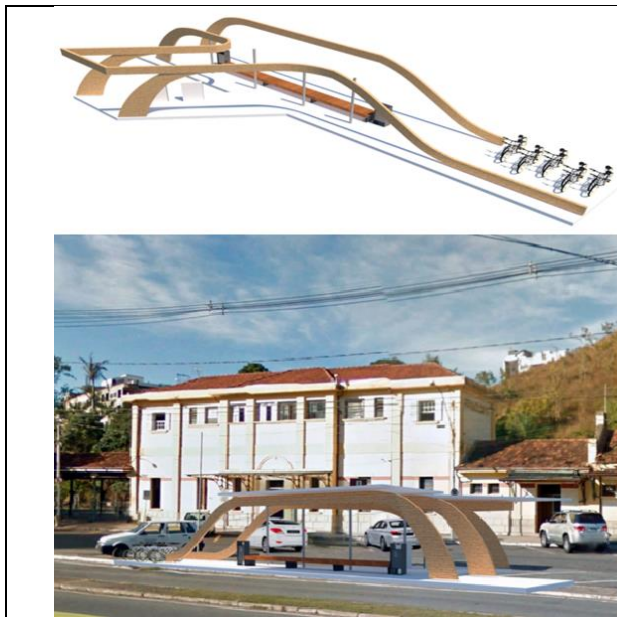
Figure 1: Campus Poços de Caldas – Electric Mobility System Implementation Project.