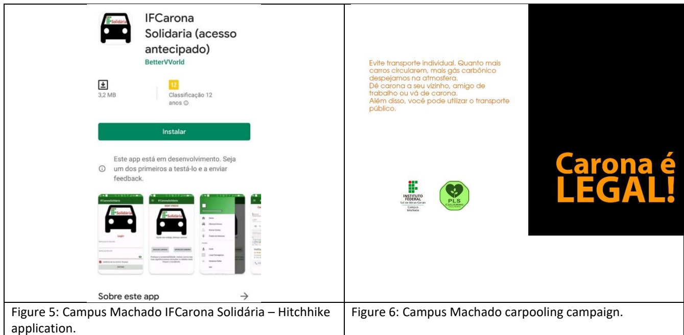
Figure 5: Campus Machado IFCarona Solidária – Hitchhike application.