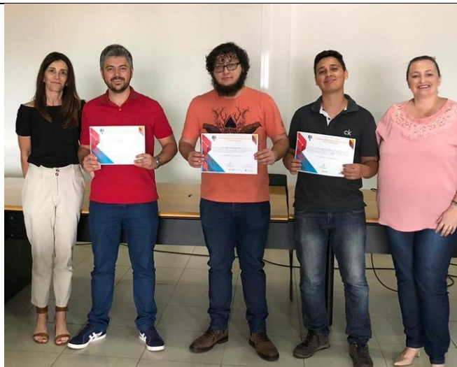
Figure 3: Campus Poços de Caldas – Automation of parking management using Arduino technologies.