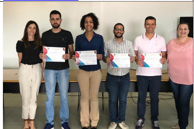
Figure 4: Campus Muzambinho – Gratified Carpool application.