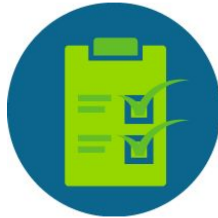
Figure 2: Standard No. 287 of 2018 and St and Standard 109/2019