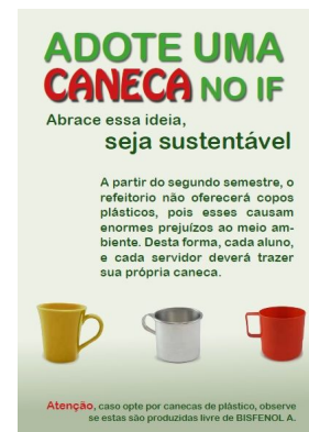
Figure 4: Campaign Reusable beverage container