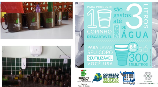
Figure 3: Policy of the use mugs