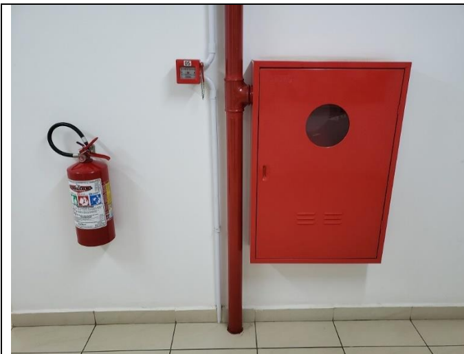
Figure 1: Rectory fire-fighting system – Fire extinguisher and fire hose.