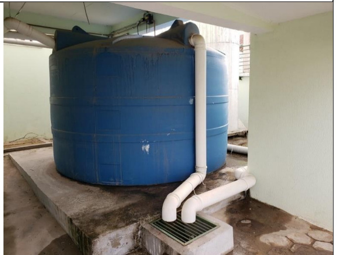
Figure 8: Rectory rainwater recovery system for covering the flushing and irrigation – Water storage tank.