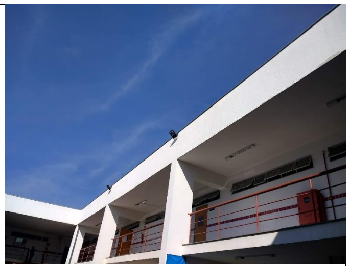
Figure 12: Campus Poços de Caldas high-efficiency luminaires with automatic lighting control – LED spotlights.