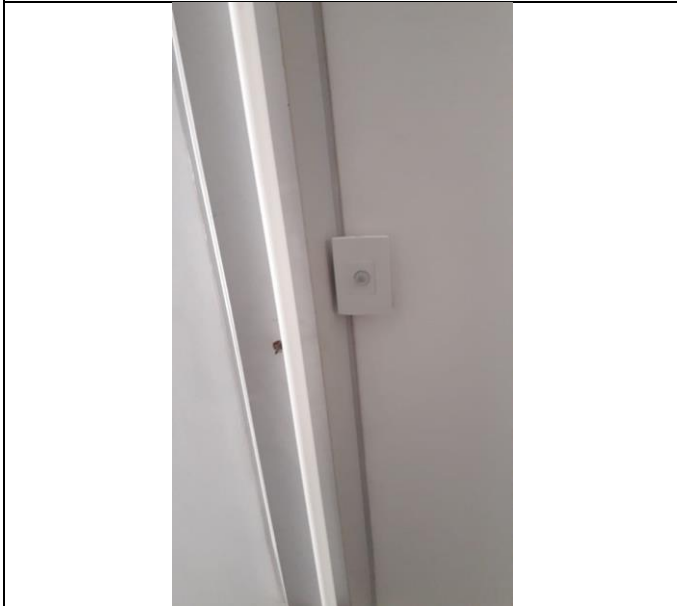
Figure 13: Campus Inconfidentes high-efficiency luminaires with automatic lighting control – Tubular LED luminaires.