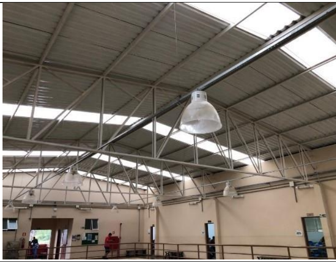
Figure 17: Campus Pouso Alegre passive systems for natural light exploitation – Engineering building.