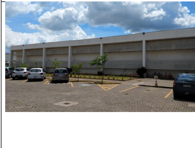
Figure 15: Campus Poços de Caldas shielding adjustment and solar control – Brise-soleil at classroom building.