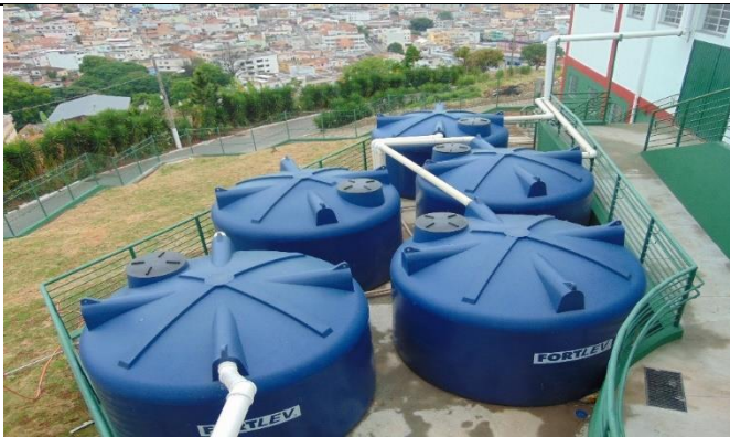
Figure 7: Campus Três Corações rainwater recovery system for covering the flushing and irrigation – Water storage tanks.