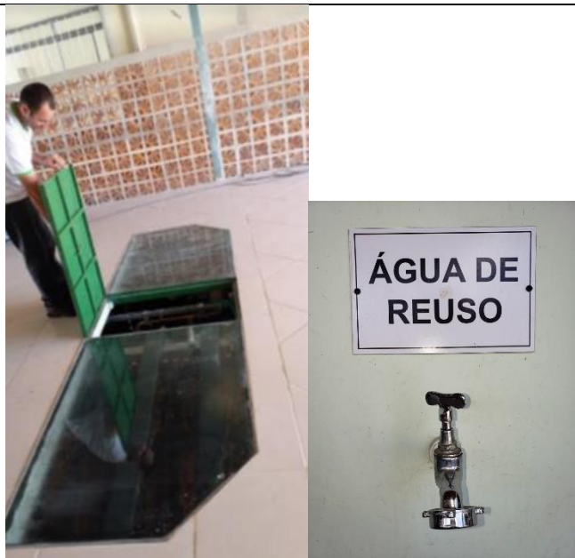
Figure 9: Rectory rainwater recovery system for covering the flushing and irrigation – Water storage tank and reuse water tap.