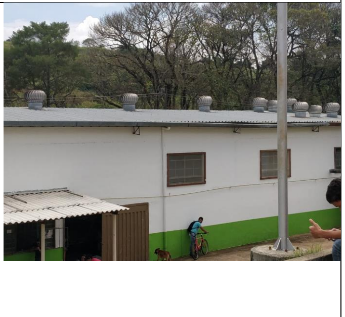
Figure 10: Campus Machado passive cooling and/or exploitation/limitation systems for free supplies – Coffee roasting building exhausters.