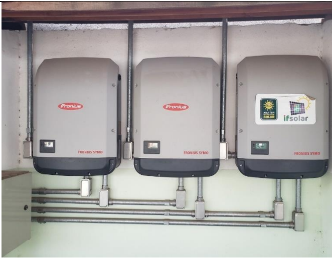
Figure 5: Rectory automatic management system for energy supplies and production – Solar power converters.