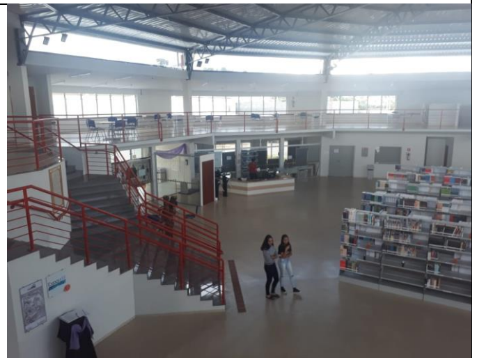
Figure 16: Campus Poços de Caldas passive systems for natural light exploitation – Library lighting.