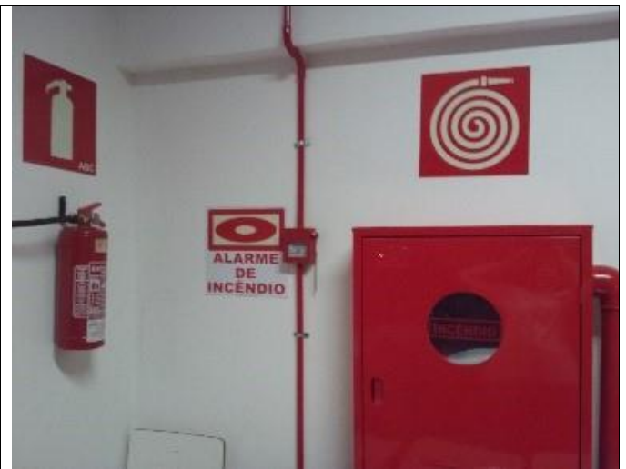
Figure 1: Campus Passos fire-fighting system – Fire extinguisher, fire hose and fire alarm.