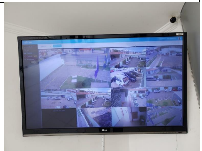
Figure 4: Rectory video surveillance system – Camera control.