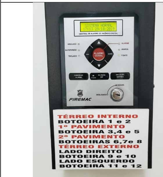
Figure 3: Rectory fire-fighting system – Fire alarm.