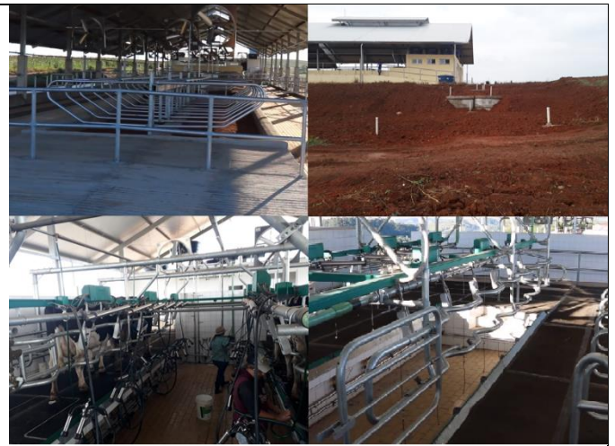
Figure 18: Campus Muzambinho monitoring of environmental parameters related to thermo-hygrometric comfort – Dairy cattle free stall.