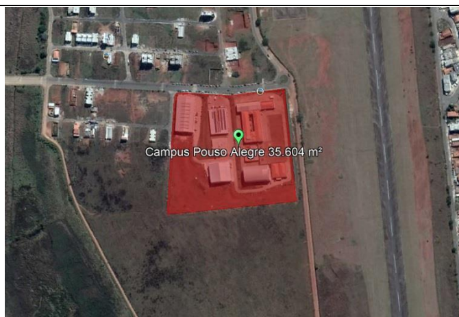
Figure 6: Campus Pouso Alegre.