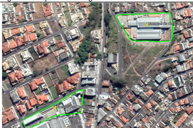
Figure 8: Campus Três Corações.