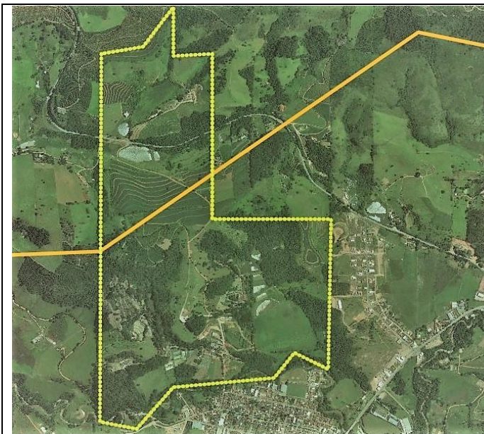
Figure 1: Campus Inconfidentes.