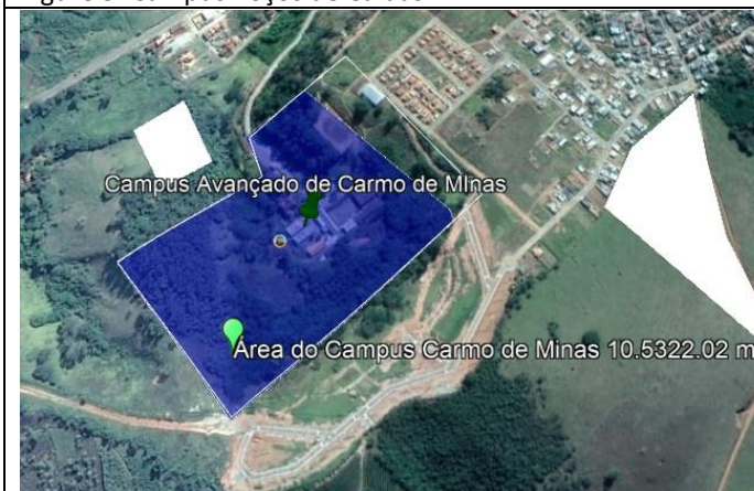
Figure 7: Campus Carmo de Minas.