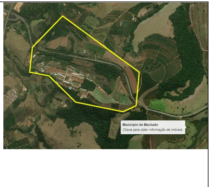
Figure 2: Campus Machado.