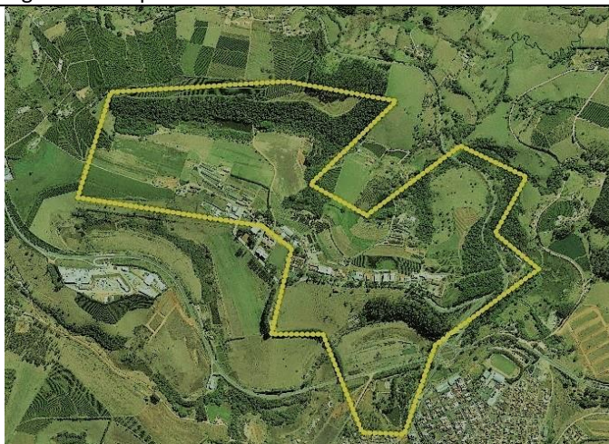
Figure 3: Campus Muzambinho.