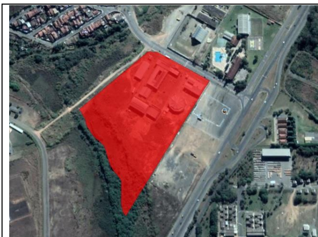
Figure 5: Campus Poços de Caldas.