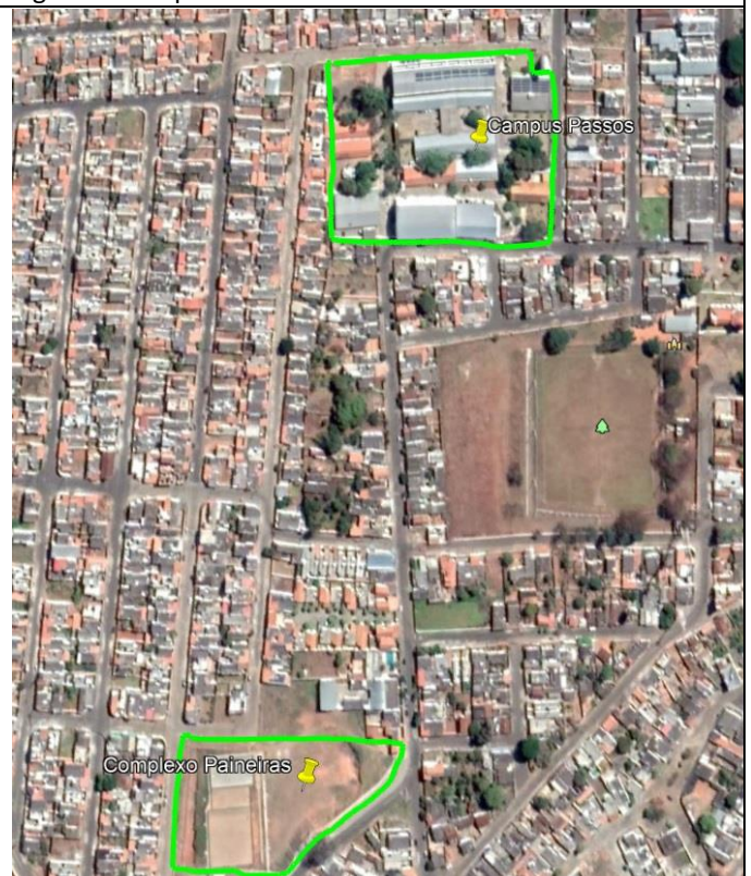
Figure 4: Campus Passos.